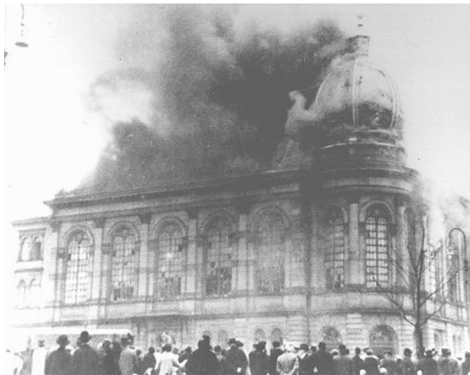
The Boerneplatz synagogue in flames during Kristallnacht (the "Night of Broken Glass"). Frankfurt am Main, Germany, November 10, 1938.

When the violence ended on the night of November 10, rioters had burned or destroyed between 1,300 – 2,000 synagogues. German city officials, anxious to remove traces of these buildings, often ordered their immediate demolition and forced the Jewish community to pay for the costs. In addition 7,500 Jewish businesses were destroyed, and countless cemeteries and schools were vandalized.