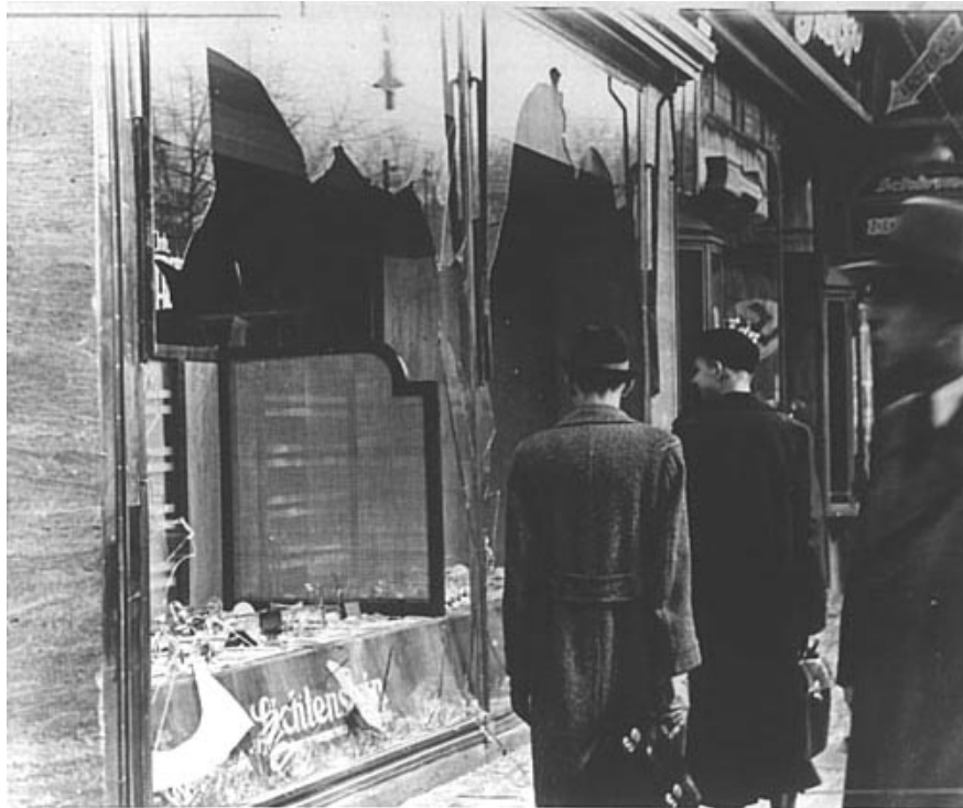
Germans view the damage caused to a Jewish-owned store in Berlin. November 10, 1938.

Jewish businesses were hard-hit during the November pogroms. Massive looting occurs as Jewish storefronts were smashed. Some 7,500 Jewish enterprises were damaged or destroyed on November 9 th and 10 th . Adding insult to injury the Jews were forced to pay the costs of the pogroms while being banned from the economy. Insurance monies to cover the damage were confiscated forcing Jewish storeowners and homeowners to make repairs at their own costs. In addition, a 1 billion Reichmarks (400 million dollars) "atonement fee" was placed on the community.