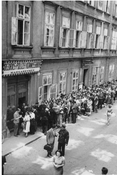
Jews hoping to receive exit visas at a police station in Vienna.

“The German night, whose observance after the passage of forty years has brought us together today, remains a cause of bitterness and shame. In those places where the houses of God stood in flames, where a signal from those in power set off a train of destruction and robbery, of humiliation, abduction and incarceration—there was an end to peace, to justice, to humanity. The night of 9 November 1938 marked one of the stages along the path leading down to hell.”